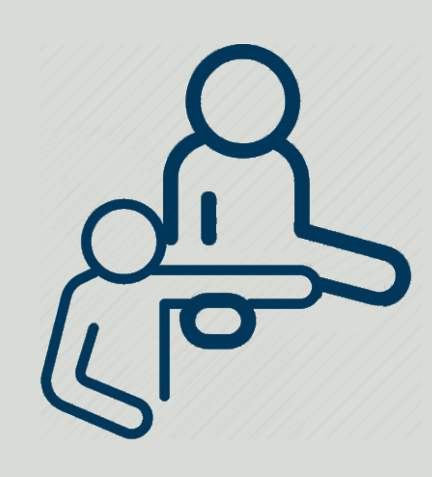
2,200+ hours of physical therapy services