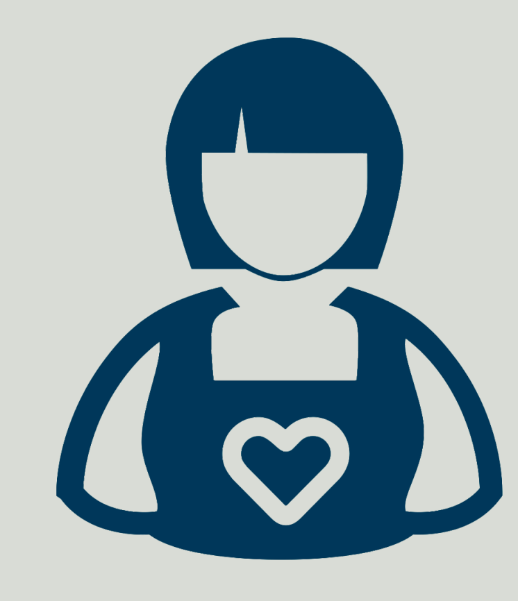
45,400+ hours of loving care from local consistent caregivers

Donations also cover other necessary costs like doctor visits, medicine, education, social workers, psychologists, and other care costs.